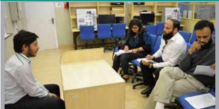
From April 24 to May 5, 2017, the Career Services and Corporate Relations (CS&CR) department organized Mock Interviews for the students of all academic departments at DHA Suffa University. The objective of these interviews was to offer graduating students a simulation of actual job interviews and to allow them immediate feedback on their performance.