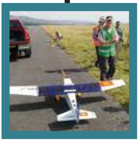
10 Team Zarrar Participates in IMechE UAS Challenge UK

10 DHA Suffa University Excels at IBA ProBattle 2017