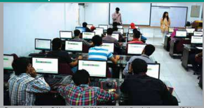
Representatives from Pakistan State Oil (PSO), the largest oil marketing company of Pakistan, visited DHA Suffa University and conducted an initial assessment of students through online internship test.